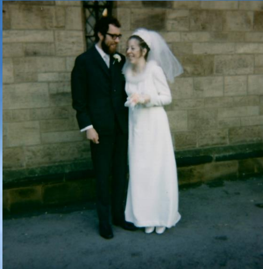
January 1971 Full head of hair!