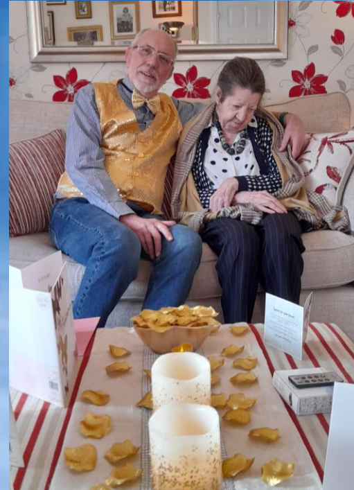
January 2021 No hair!!